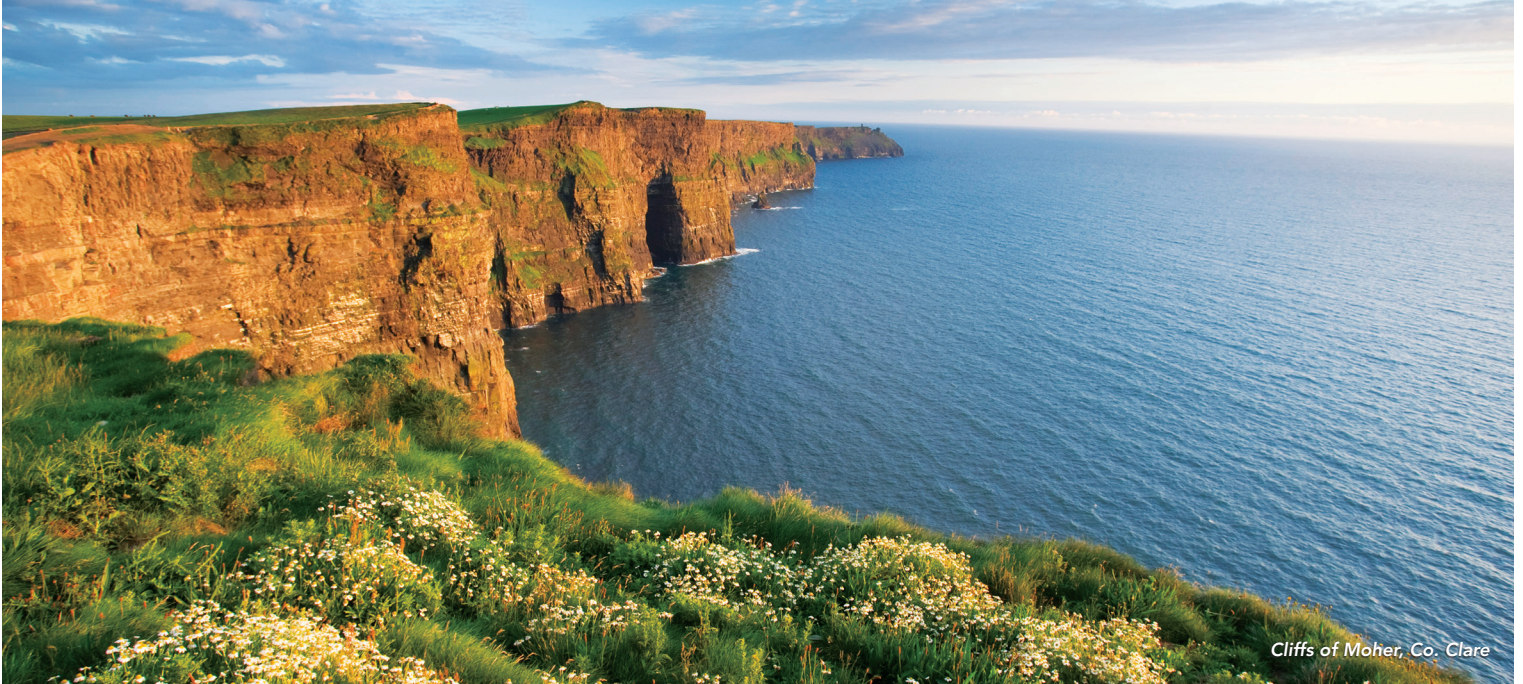
Cliffs of Moher, Co. Clare

Perfect for first-timers, our most popular tour visits highlights including the scenic Ring of Kerry, legendary Blarney Castle, and the stunning Cliffs of Moher.