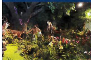
Visit to the Amazing Creation Museum!