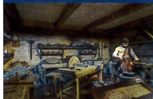
View from Inside the Ark Encounter

Day 6: Today, after enjoying a Continental Breakfast, you depart for home... a perfect time to chat with your friends about all the fun things you've done, the great sights you've seen and where your next group trip will take you!