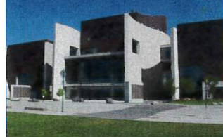
National Underground Railroad Freedom Center